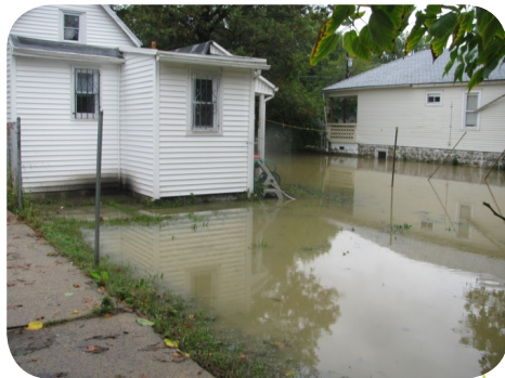
Flooding in the City of Camden after a typical rain event.

Saving water helps save money for you, and keeps money in your pocket.