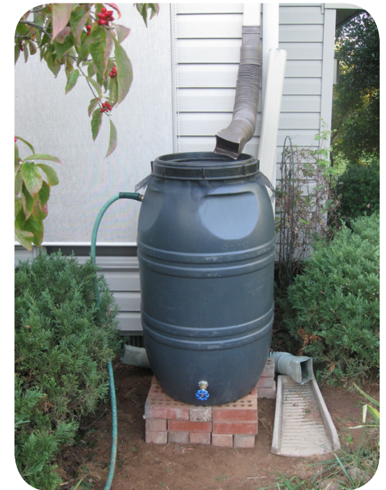
Install a rain barrel at your house!

The more you conserve, the more you save!